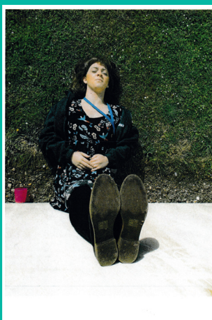
'Edge of the World.' 2017 Joint 2nd place winner KS1&2.