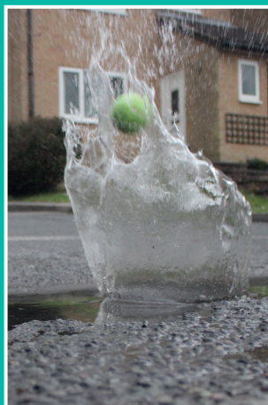
'Bouncing Back.' 2019 1st place winner KS3.