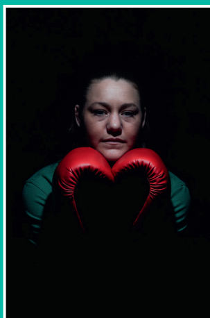
'To Love, Not Fight.' 2016 2nd place winner KS4.