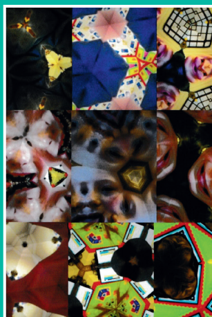
'Faces of Fun.' 2015 1st place winner KS1&2.