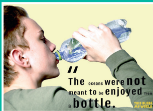
'This Globe My World.' 2018 2nd place winner KS3.