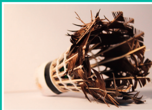
'The Retired Shuttlecock.' 2021 1st place winner KS4.