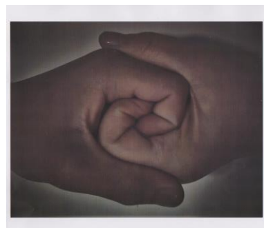
Winner of the KS3 photography category

Participation and enthusiasm amongst students and staff was certainly not affected by the circumstances with the Connections theme really seeming to resonate with everyone that took part. It led to some incredible creativity, effort and diversity around how the idea was interpreted across the three creative categories and key stage groups.