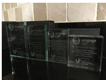
2020 National Creative Awards trophies

The National Creative Awards has always encouraged and celebrated the creativity of students and staff from the national network of member schools. But when the winners of the 2020 scheme were announced in early June, the positivity of this story at such a challenging time was even more welcome. Social media provided a platform to share the good news widely, offer congratulations and celebrate success.